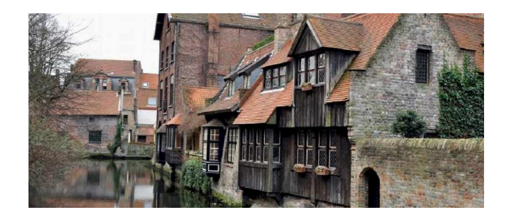
<u>Skift.com</u>: <u>6 Charts on How Bruges Residents Grudgingly See Overtourism's</u> Value

Bruges (Belgium), with 100,000 inhabitants and 8 million visitors in 2016, has become an example of tourism management. "We live in this sector and we try to make the people who live here understand and like the visitors", explains the mayor, Renaat Landuyt. "Any measure first is for the benefit of those who live in the historic center of Bruges, if we make the center a good place to live, visitors will also appreciate it."