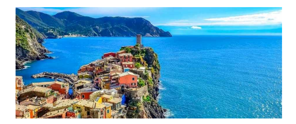
<u>Smithsonian.com</u>: <u>Italy to Limit Tourists to Cinque Terre</u>

tourists a year. According to The Independent, its managers plan to put a maximum number of tourists of 1.5 million annually. Once surpassed, access to tourists will be closed.